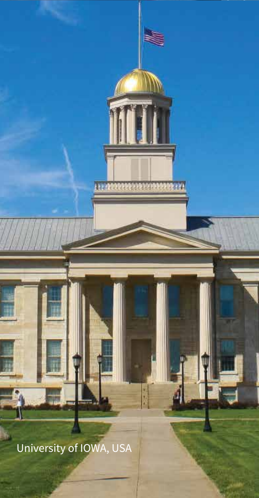
University of IOWA, USA