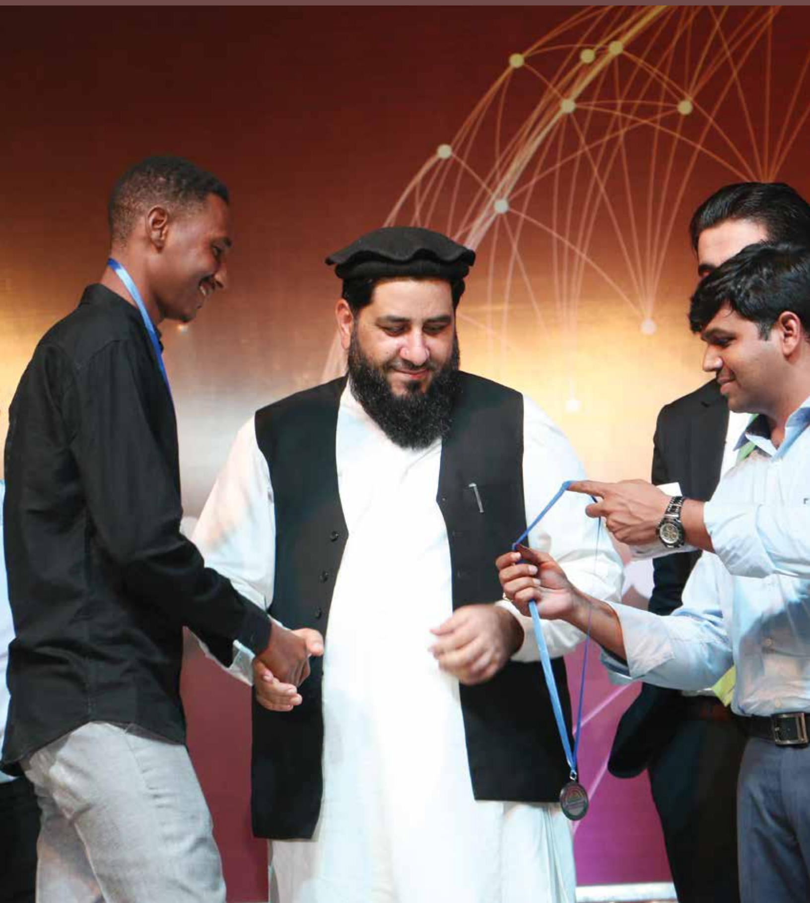
Fazal Hadi Muslimyar, Speaker of Senate of IRoA (Afghanistan) at Aditya on International Students Day